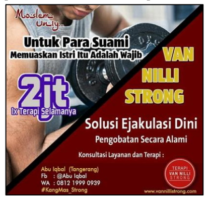
Figure 2. A leaflet of an exercise to strengthen sexual relations called "Vannilli Strong" published by forumpoligamiindonesia.com

Viewing this phenomenon, Rahayu proposes four hypotheses. First , the segmentation targeted by this association is the urban community who is considered as experiencing a certain crisis in their monogamous marriage. Such a situation becomes an opportunity to promote polygamous marriage as the solution to the problem. Second , the promotion on polygamy can be a part of electoral political interest. Indirectly, the targeted polygamy practitioners, Rahayu referred it as consumers, will be organized and mobilized to support particular political party. Third , as promoted by FPI, polygamy is an effort to set it as business commodification to generate revenue. Fourth , the effort conducted by FPI is aimed at building polygamous economy in capitalist society which is set up in a religious spirit.<sup>55</sup>Among the four aforementioned hypotheses, we argue that the strongest evidence